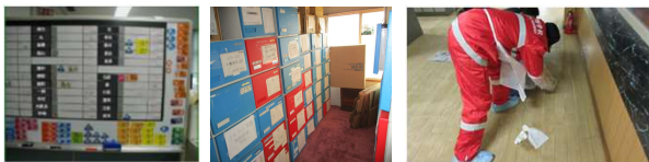
Posted schedules Rearranged files Emergency training Fig. 2. Examples of communication measures.

This study aimed to learn, from recent participatory programs, emergency measures commonly planned through workplace dialog in varied sectors.